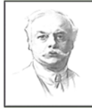
Kenneth Grahame Society